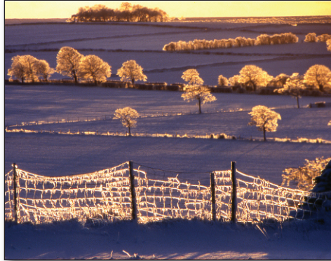
The low late-afternoon sun shines through the ice-coated landscape making the trees and the fence look like they are glowing.