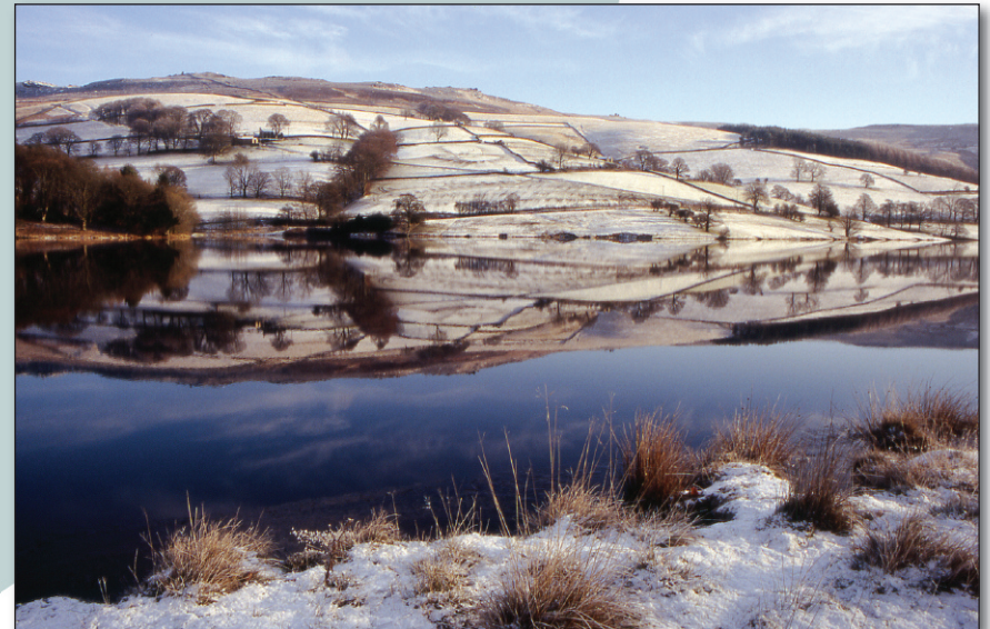
The snowy hills around Ladybower Reservoir are perfectly reflected in the water.