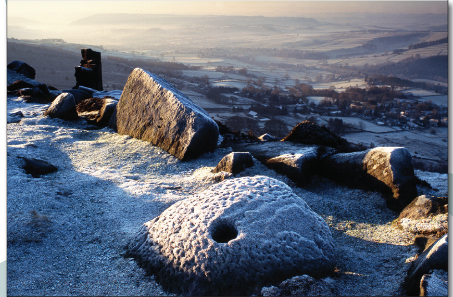
A half-buried millstone on top of Curbar Edge catches the low morning light.