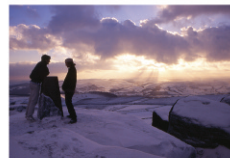
Stanage Edge is a very popular place to visit for rock climbing, walking, or just to admire the view across the Peak District.