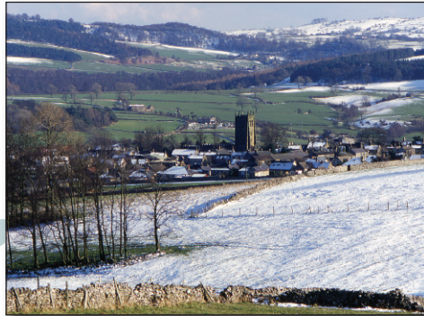
The impressive church in Youlgrave stands out against the winter landscape.