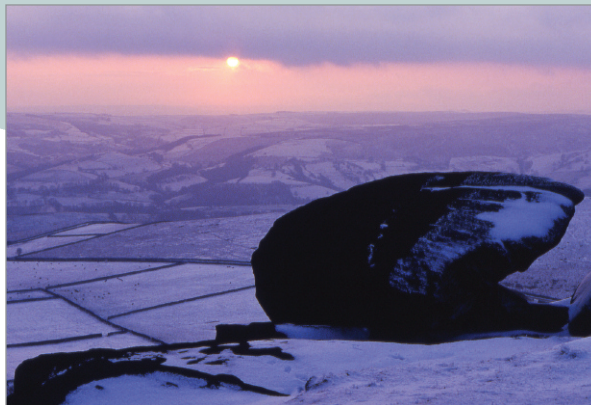
(Left) The setting sun gives the sky a warm glow over Stanage Edge.