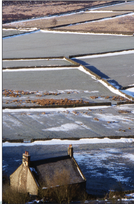
Overstones Farm is perched high above the Hope Valley at the eastern end of Stanage Edge, next to a patchwork of fields belonging to the farm.